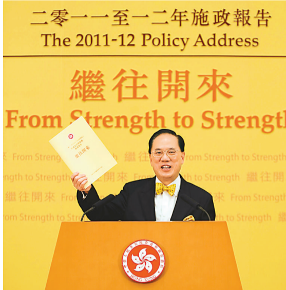
▲特首曾蔭權 12 日在記者會上向傳媒展示他任內最後一份施政報告

不會介入樓市、不會復建居屋, 因為「八萬五」教訓深刻; 但過去短短一年時間裡, 樓價如脫韁野馬直線上升, 本來有能力、有計劃買私樓的市民都只能望門興嘆, 甚至慘成「劊房一族」, 社會上因而怨氣大增。如果這時候政府仍堅持不介入、不復建, 則不但無法化解社會矛盾, 「福為民開」也將成爲一句空話。