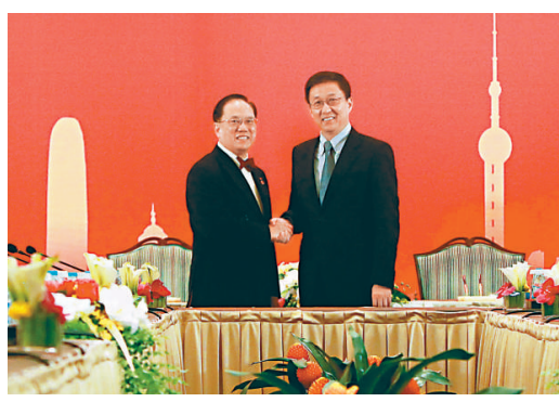
▲上海市市長韓正(右)與香港特別行政區行政長官曾蔭權在簽約儀式上合影