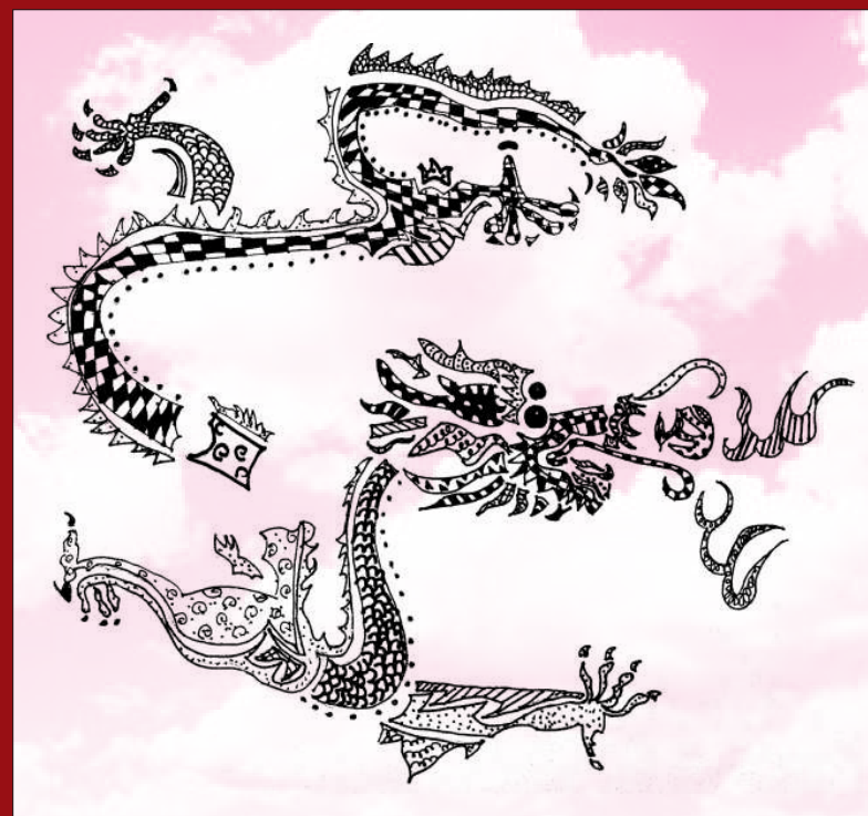
耀中國際學校小學部 5年級 林慧欣